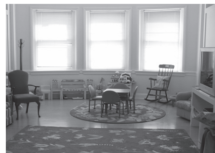
The New Baltimore Child Abuse Center, Inc., Waiting Room