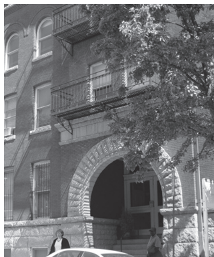
The New Baltimore Child Abuse Center, Inc., 2300 N. Charles Street

Child Abuse Center, please call: (410) 396-6147.