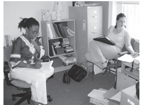
BCAC, Turn.Around Staff